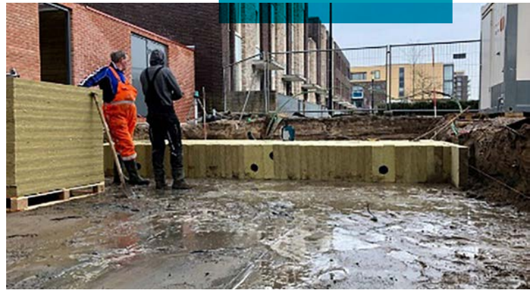
Installation of a Rockflow system in a new residential area.

Stone wool retains its shape and size, even under heavy loads (20 tonnes axle load). This makes it ideal to be installed beneath roads, buildings, tramlines or car parks, minimising the land take dedicated to drainage. Approximately 1% consolidation occurs during installation. Subsequently less than 2% deformation occurs over a period of 50 years, making a Rockflow system stable in shape and size throughout its entire lifespan. This is confirmed by research by the independent research institute Deltares and internal tests. Rockflow therefore complies with civil engineering standards. Within ROCKWOOL we have vast experience in exploiting the stability of stone wool under heavy loads. In Oslo, Norway our stone wool has been in situ for decades under a tramline (in the form of Rockdelta, to dampen vibration). After several decades we measured the density, form stability and functional properties of the stone wool. These were found to be the same as on the day it was installed.