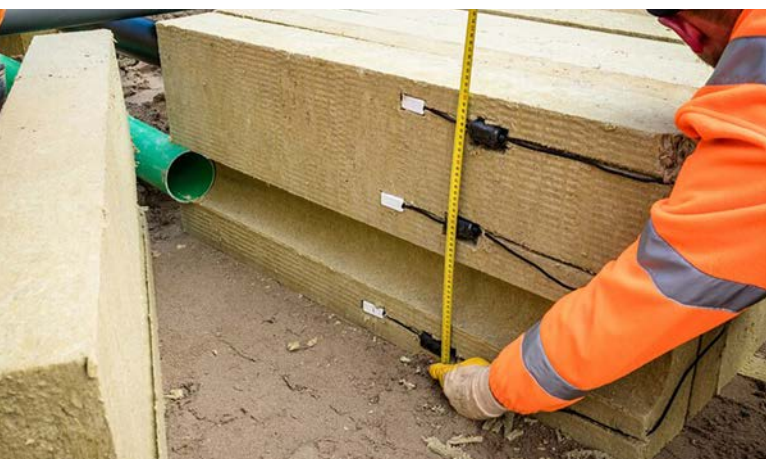
Stone wool in use under a tramline.

Do you want to know with certainty that a Rockflow system is working correctly? Install water level meters and moisture sensors for extra peace of mind. Our own monitoring data over the course of several years and Dutch projects in Schimmert, Roermond, Horst aan de Maas, Zevenaar and overseas projects, consistently show that the water is absorbed immediately and the system empties quickly, getting ready for the next rainfall event. Monitoring of our system has been carried out by engineering consultants IB-land, Kragten, Royal HaskoningDHV and others.