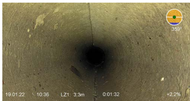
Stone wool in use under a tramline.

For all these criteria Rockflow easily exceeds the projected lifespan of 50years, provided the system is correctly designed and is cleaned every 2-3 years. The research concluded that well after the simulated lifespan a Rockflow system is still perfectly capable of meeting current Dutch requirements for drainage (40mm/m 2 /h), and even the future stricter drainage norm (76 mm/m 2 /h).