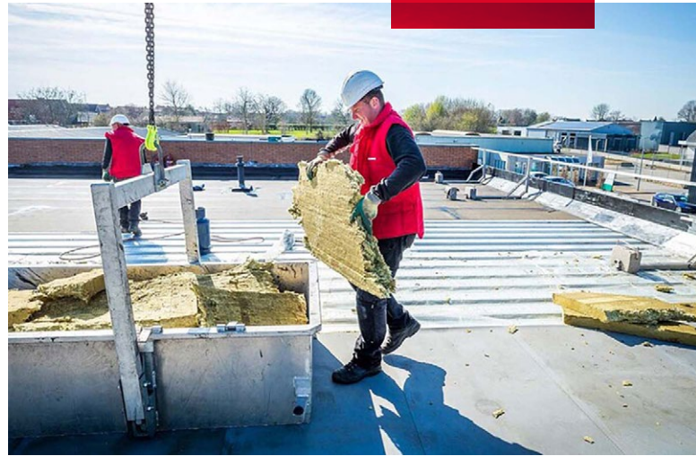
Collecting stone wool for recycling during a renovation

Cost Indicator (in Dutch: Milieu Kosten Indicator) that records how much it would cost in euros to compensate for the negative environmental effects of a product. For Rockflow, this MKI value is 11.8EUR/m 2 of stone wool. This is lower than the MKI value of a plastic system in part because plastic systems are not expected to have the same longevity.