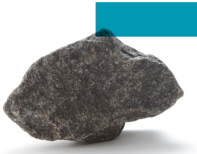
Basalt in its natural state.

ROCKWOOL's stone wool, including Rockflow, is primarily made of basalt. This is a natural resource renewed by volcanic activity. What's more, every year the earth produces 38,000 times more volcanic rock than we use in the production of stone wool. ROCKWOOL's annual consumption of volcanic rock is approximately 1% of the annual production of the Kilauea volcano in Hawaii. However, the basalt that Rockflow uses does not come from there! We source basalt locally, including from the Eiffel region of Germany. In Roermond in the southeast Netherlands, we process it to make stone wool.